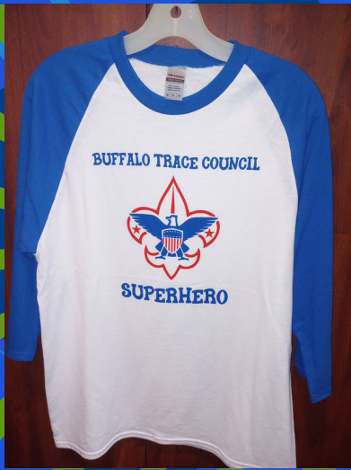
BTC Superhero Shirt $19.99

We continue to have some items on backorder and we apologize for the inconvenience. We are greatly appreciative of your understanding and patience as we work on getting these items back in stock. Items currently on backorder include Archery, Nature, and Photography Merit Badges, Camping National Outdoor Award, 2XL adult uniform shirts (tan), Webelos Colors, and Youth Cub Scout Pants.