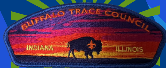
New Buffalo Trace Council Strip $5